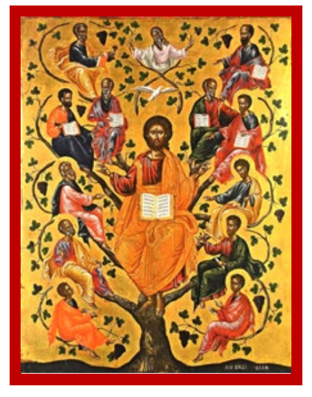
'Christ the true vine'

St Mary's Church of England School St John's Church of England School Diocese of Oxford